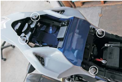
3. Remove upper tail. 4 Bolts. Unplug tail light. Slide tail up and back to remove.