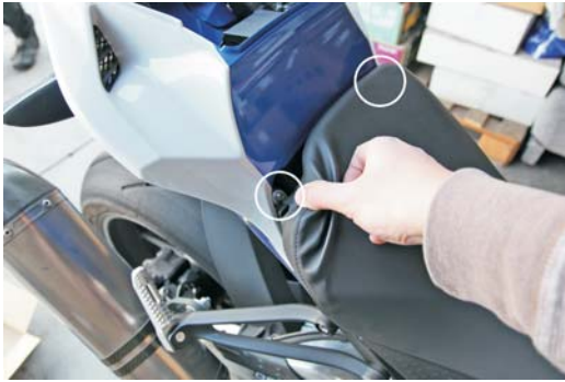
1. Remove seat. 2 Bolts.

“R” = blue wire turn signal “L” = yellow wire turn signal