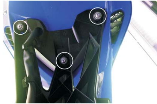
2. Remove rear fender. 3 Bolts. Disconnect main harness.