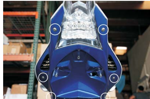
4. Separate upper/lower tail. 6 Bolts and unclip. Pop vents outward (3 clips).

** If front turn signals are factory, please bypass the resistor kit and do not install it